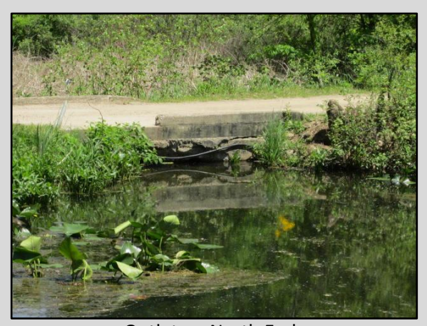
Outlet on North End

Click here to join LLCA Click here for more information about LLCA