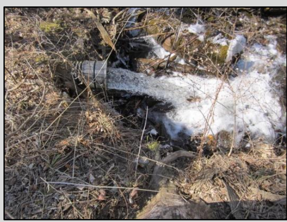
Inlet from Cloverdale Lake