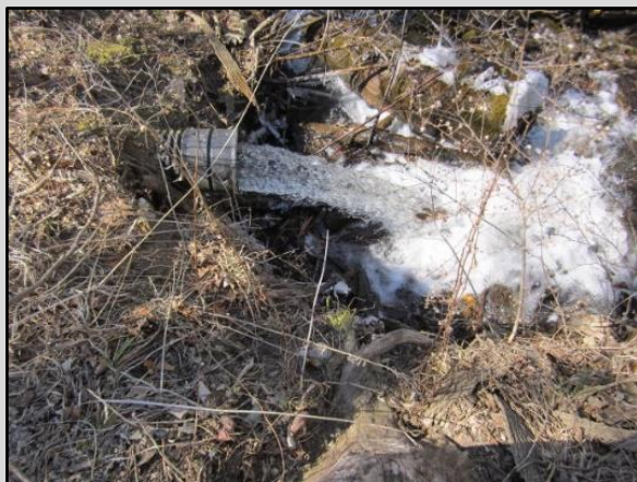
Inlet from Cloverdale Lake