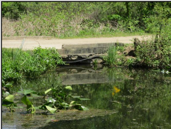
Outlet on North End

Click here to join LLCA Click here for more information about LLCA