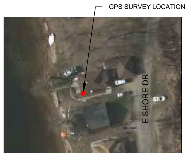
10894 E. SHORE DR