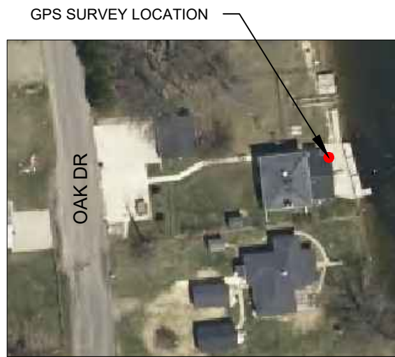
11333 OAK DR