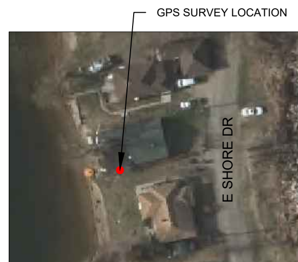
10900 E. SHORE DR